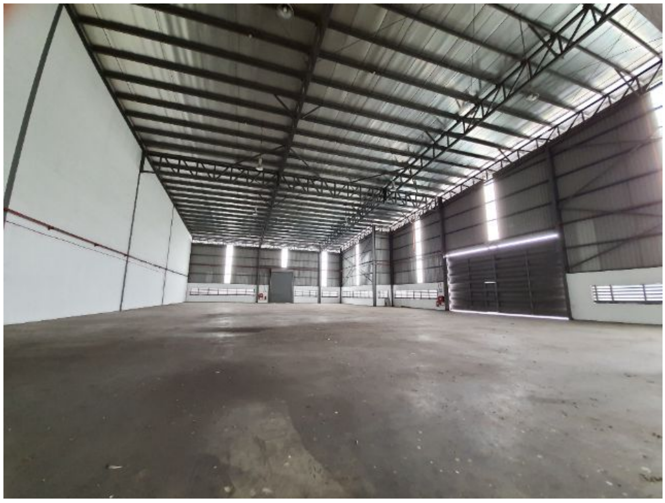
Page 3 of 3