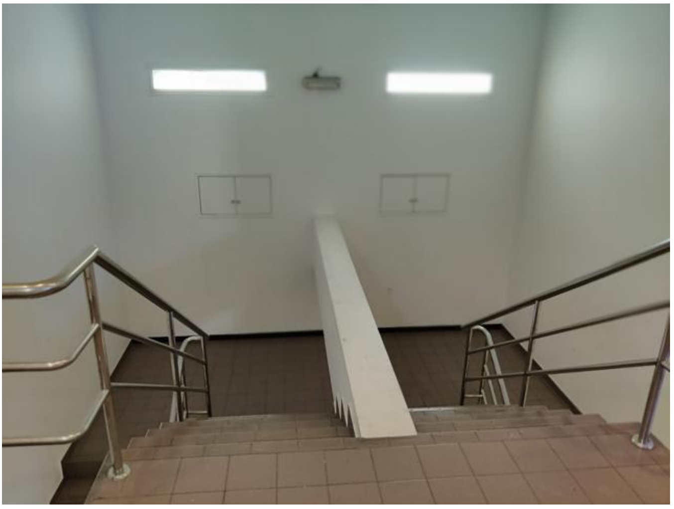
Page 3 of 4