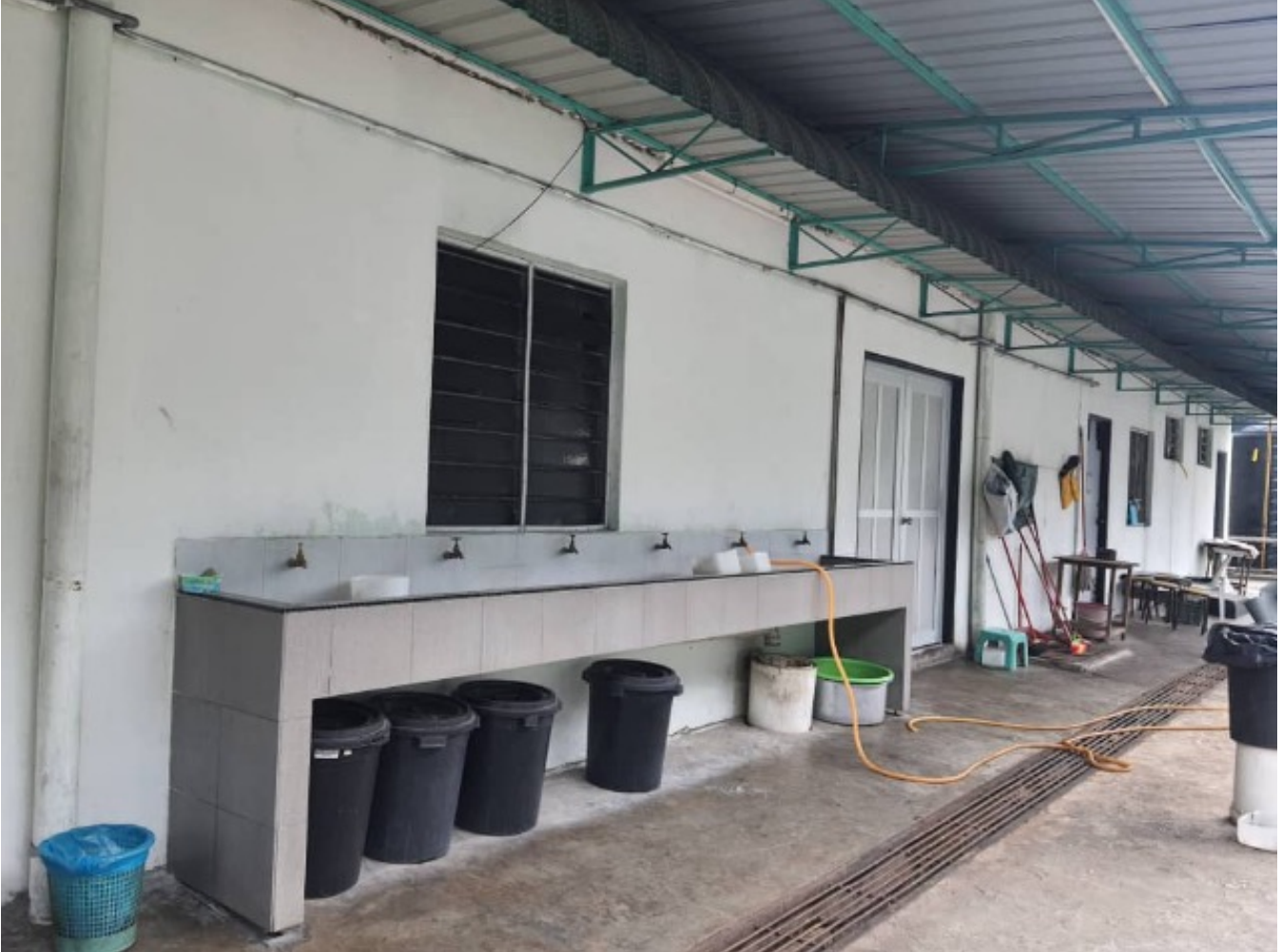
Page 4 of 4