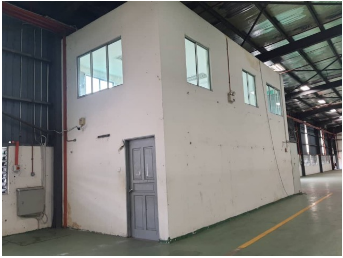
Page 3 of 4