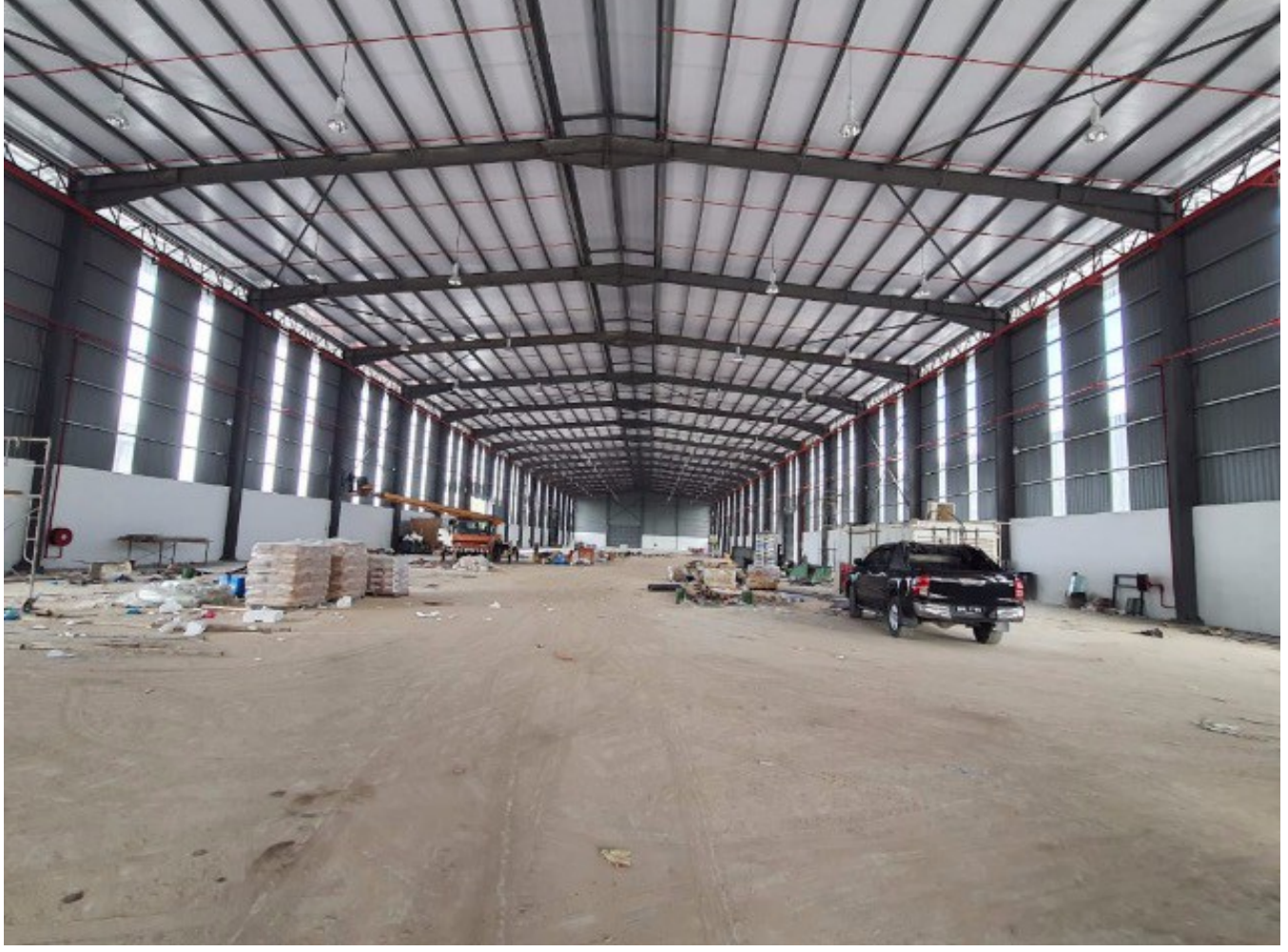
Page 3 of 3