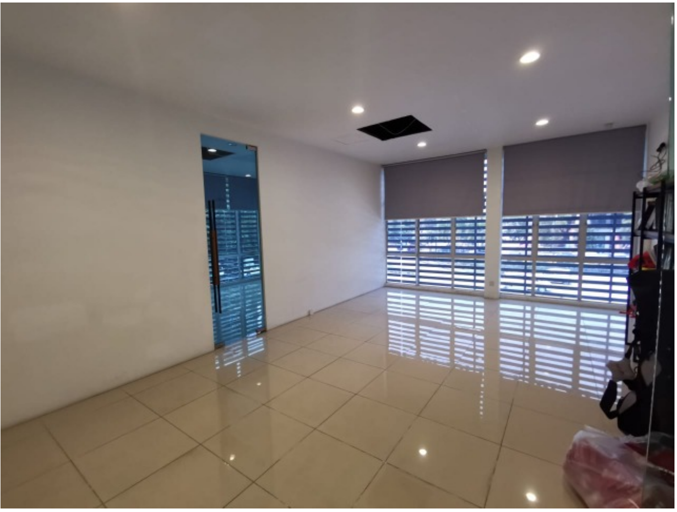
Page 3 of 4