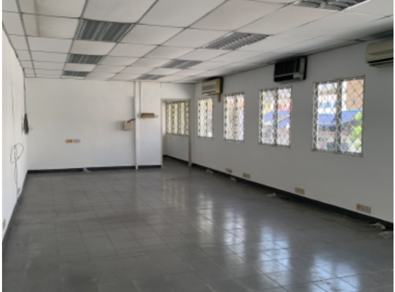
Page 3 of 5