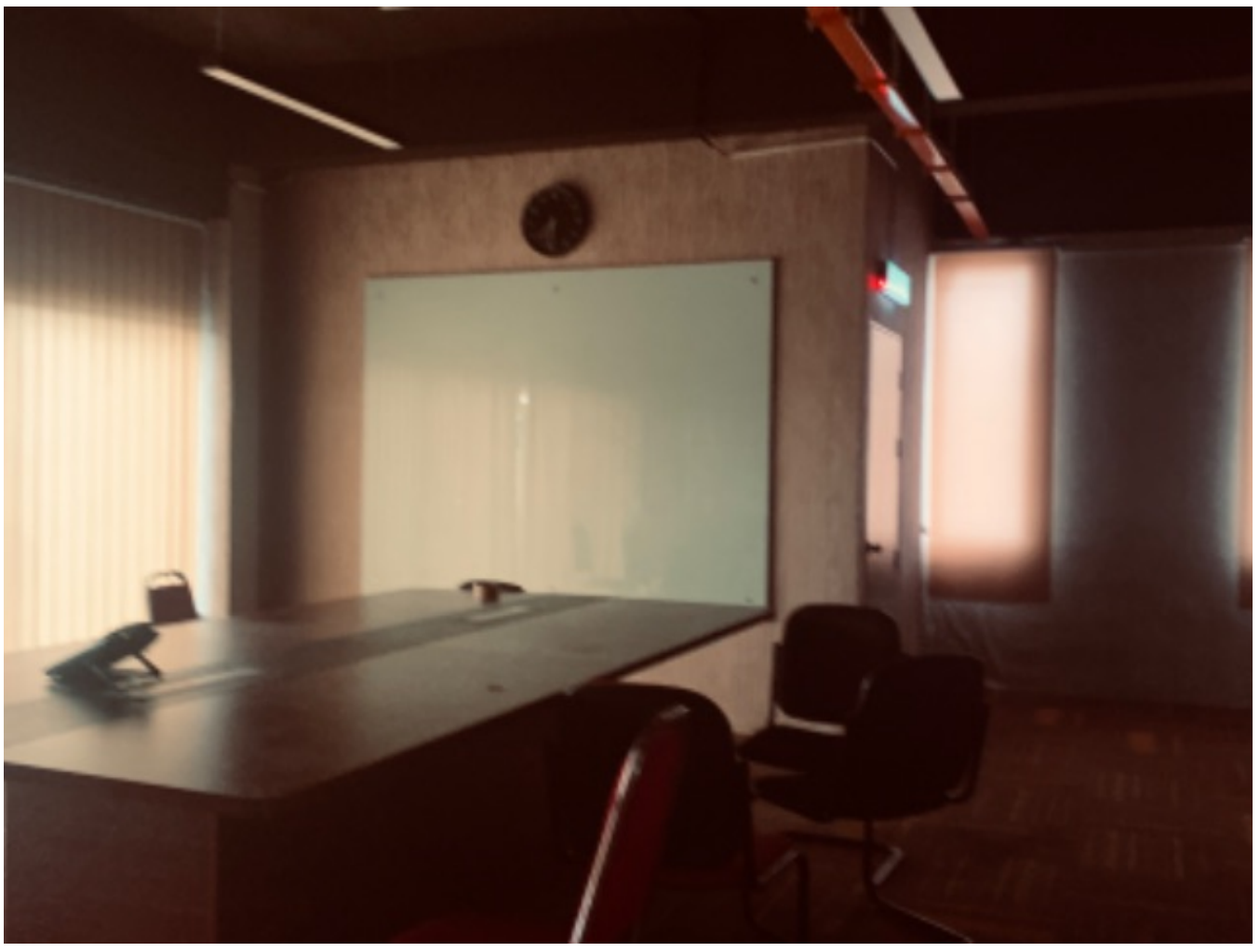
Page 3 of 4