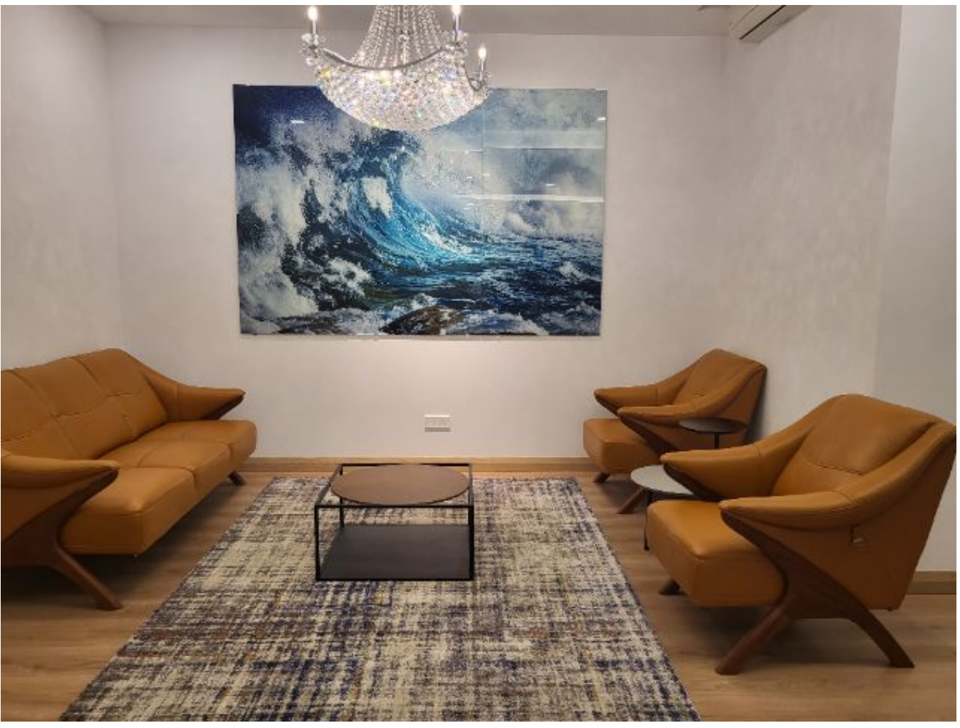
Page 3 of 6