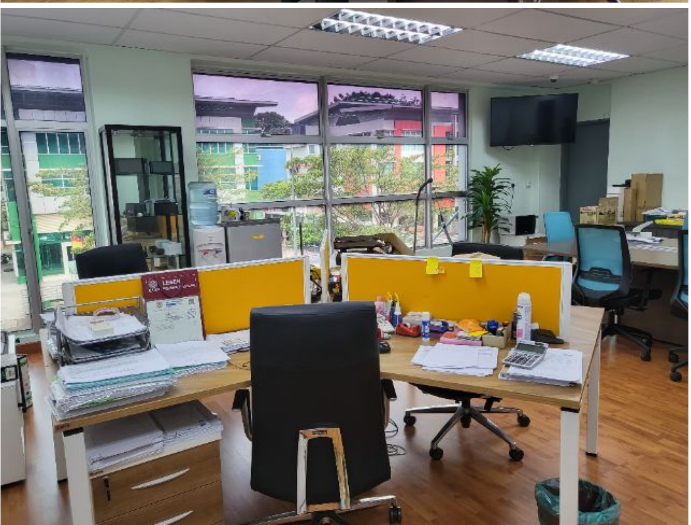
Page 5 of 6