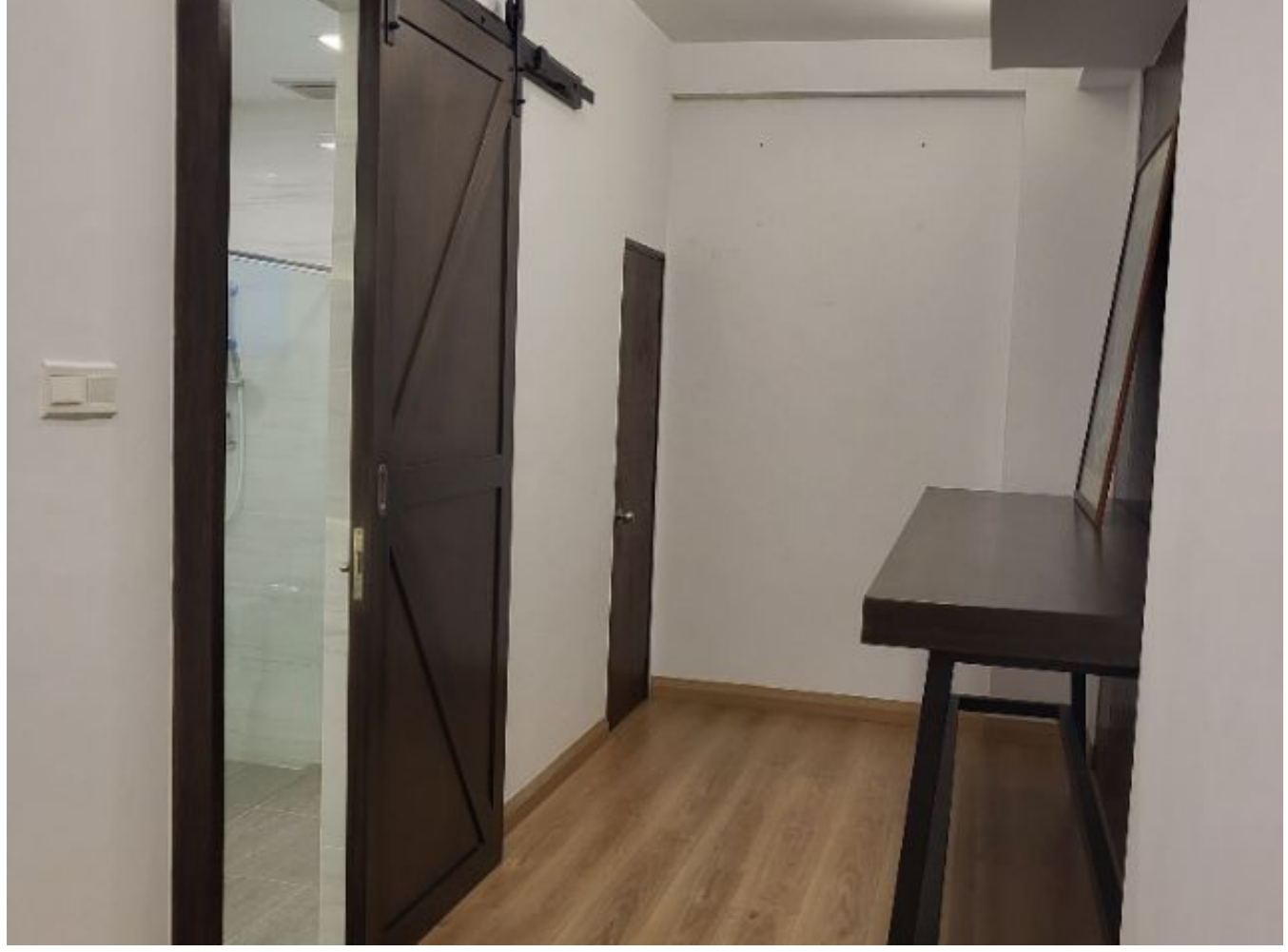
Page 4 of 6